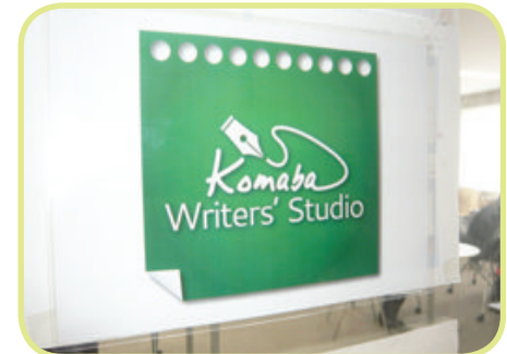
Komaba Writers' Studio.