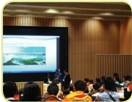
Indian delegation at KOMCEE 21.

On November 28, 2011, about 150 high school students from India visited Komaba campus as the last event in their 9-day trip to Japan. They looked around the campus in small groups guided by Todai student volunteers, and had a workshop presentation in the 21 KOMCEE Lecture Hall in the evening.